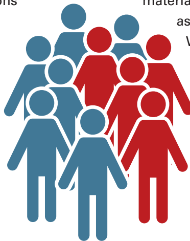
Over 50 percent of consumers expressed interest in purchasing customized products or services.

We will then review the new era of printing solutions that make production of these items easy and highly affordable.